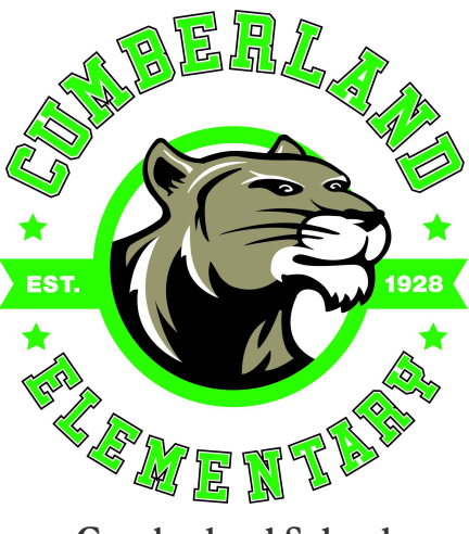
Cumberland School 4780 N. Marlborough Drive Whitefish Bay, WI 53211

Main Office, Health Room, and Website Information