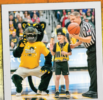
KIDS @ CAMP

Questions? Contact Nicole Boemer nlboemer@gmail.com